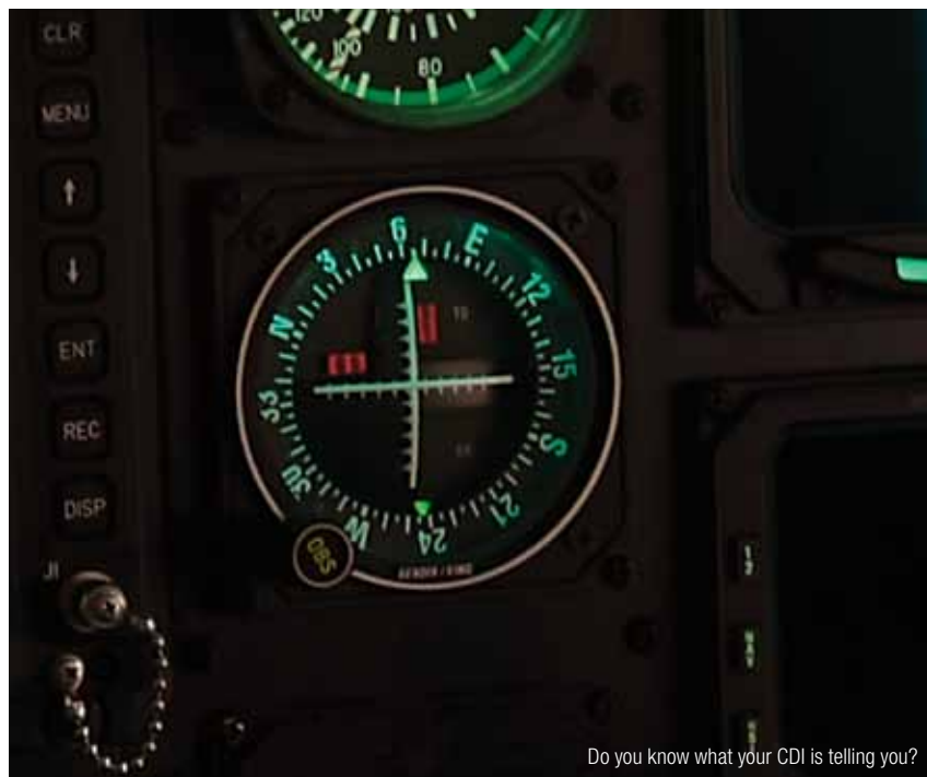
Do you know what your CDI is telling you?

The typical CDI has four “dots,” or marks, to the left and right of center. If you were flying on a VOR radial, each dot would represent a two-degree “angular” deviation — that is, a deviation of two degrees off the desired radial. (Recall that VOR — very high frequency [VHF] omnidirec-