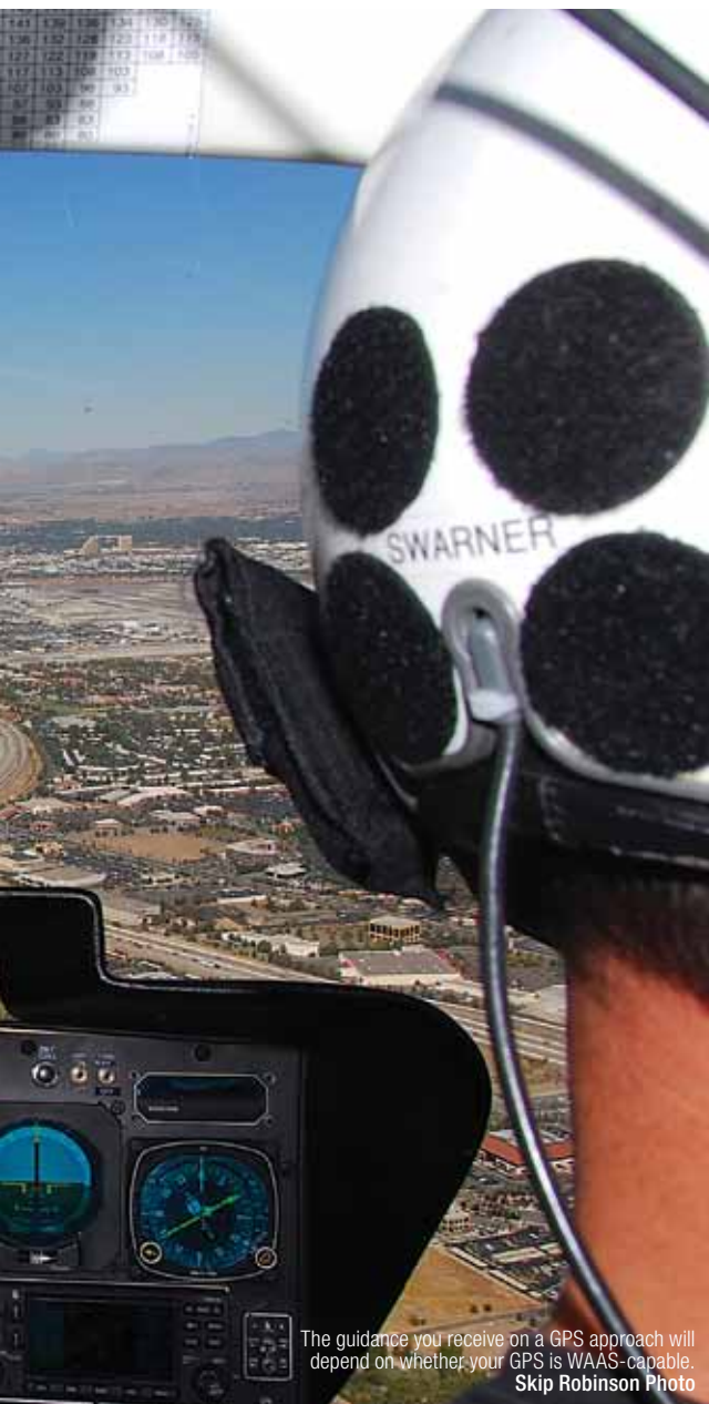
The guidance you receive on a GPS approach will depend on whether your GPS is WAAS-capable.

For those of you who have had the pleasure of “chasing the needle” on a non-precision GPS approach, you are hopefully familiar with the varying levels of sensitivity seen on your course deviation indicator (CDI) throughout the various stages of the approach. What you may not realize is that CDI sensitivity varies between older, “traditional” GPS receivers and new WAAS (Wide Area Augmentation System) capable receivers. That means which type of receiver you are using can have an important impact on how you fly the approach.